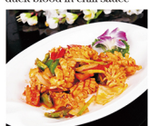
辣烧鱿鱼 AED 26 spicy fried squid