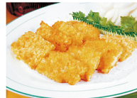
炸鱼排 AED 28 deep fried fish chops