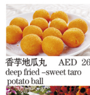
香芋地瓜丸 AED 26 deep fried -sweet taro potato ball