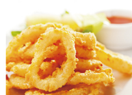
炸鱿鱼圈 AED 28 Deep-fried squid rings