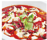
沸腾水煮鱼 AED 48 fish in hot chili oil