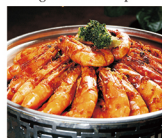
干锅香辣虾 AED 48 grilled cook spicy shrimp