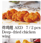
炸鸡翅 AED 7/2 pcs Deep-fried chicken wing