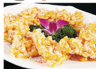
香甜玉米烙 AED 28 sweet corn roast