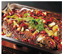
江湖烤鱼 jianghu grill fish AED 88