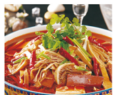
毛血旺 AED 58 duck blood in chili sauce