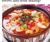
水煮虾球 AED 48 spicy boiled shrimp ball