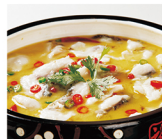
酸菜鱼 AED 48 boiled fish with pickles cabbage and chili soup